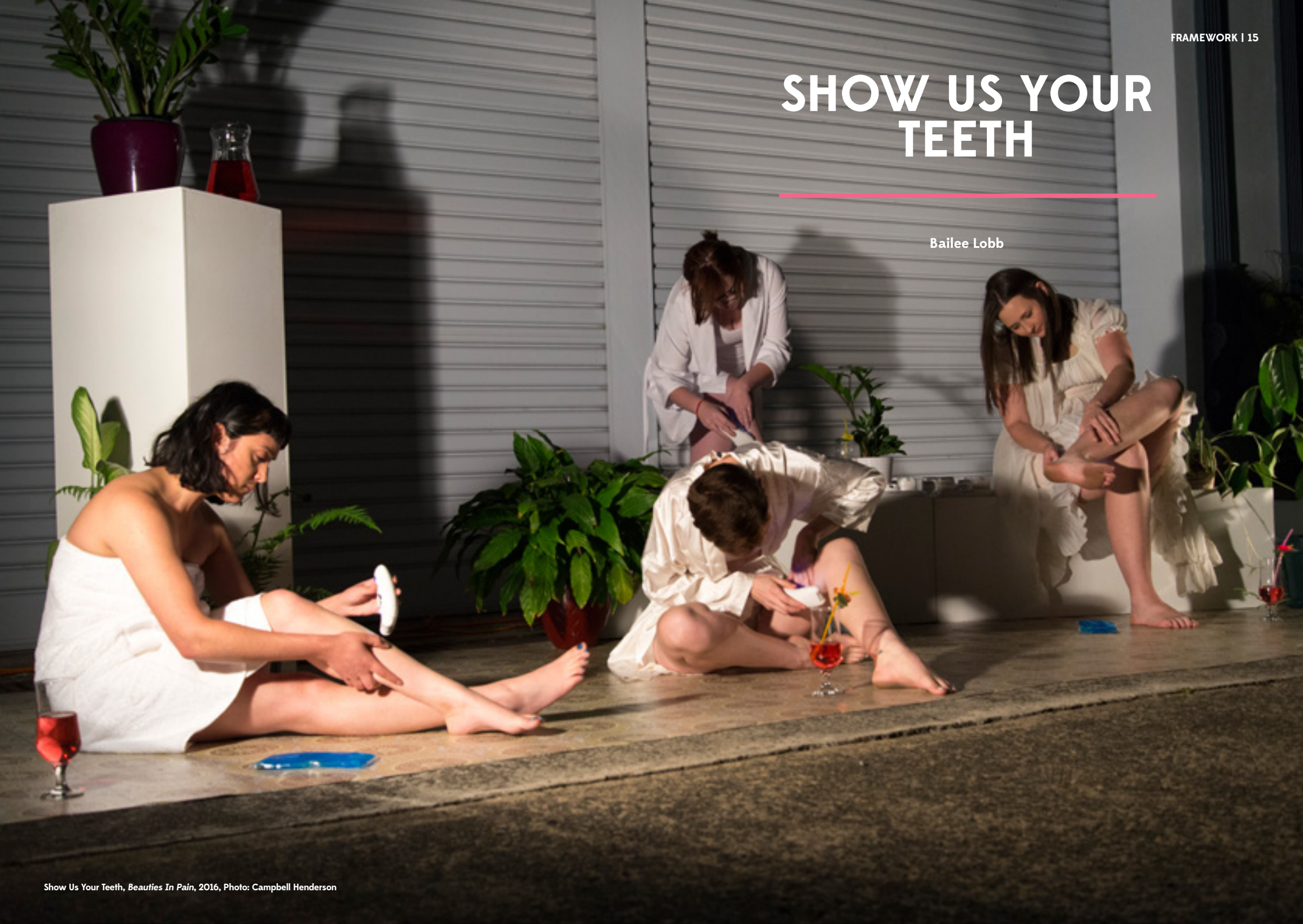
Show Us Your Teeth, Beauties In Pain , 2016, Photo: Campbell Henderson